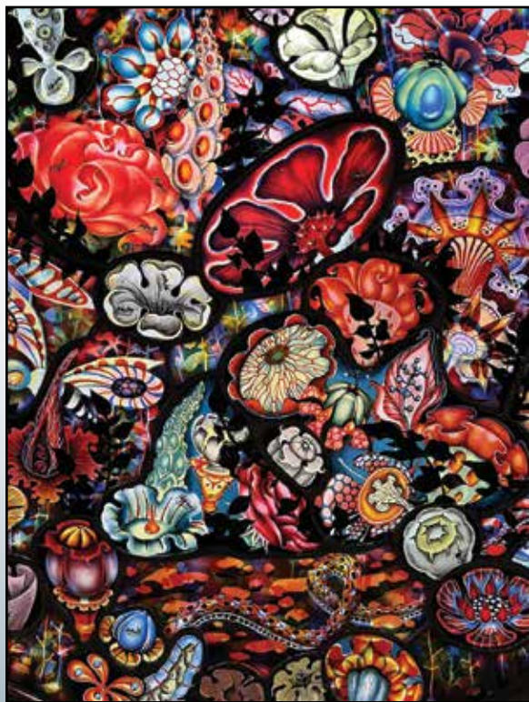
Judith Schaechter, Super/Natural (detail), full installation is 96" x 60" x 60", engraved flashed glass, silver stain, and enamel, 2025.