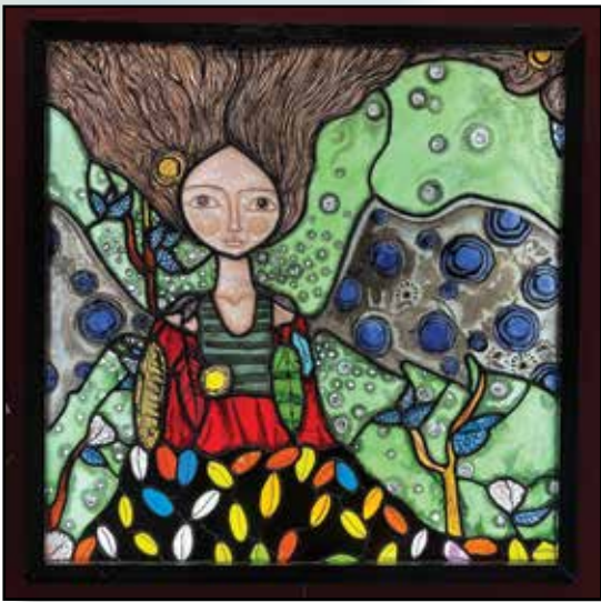
Alvaro Maury, Untitled Work , stained glass, 2021.

Conference attendees will also have the opportunity to attend the opening of American Glass Now: 2025 . This is a juried exhibition on view at the Mesa Contemporary Arts Museum (MCAM) from May 19–August 3.