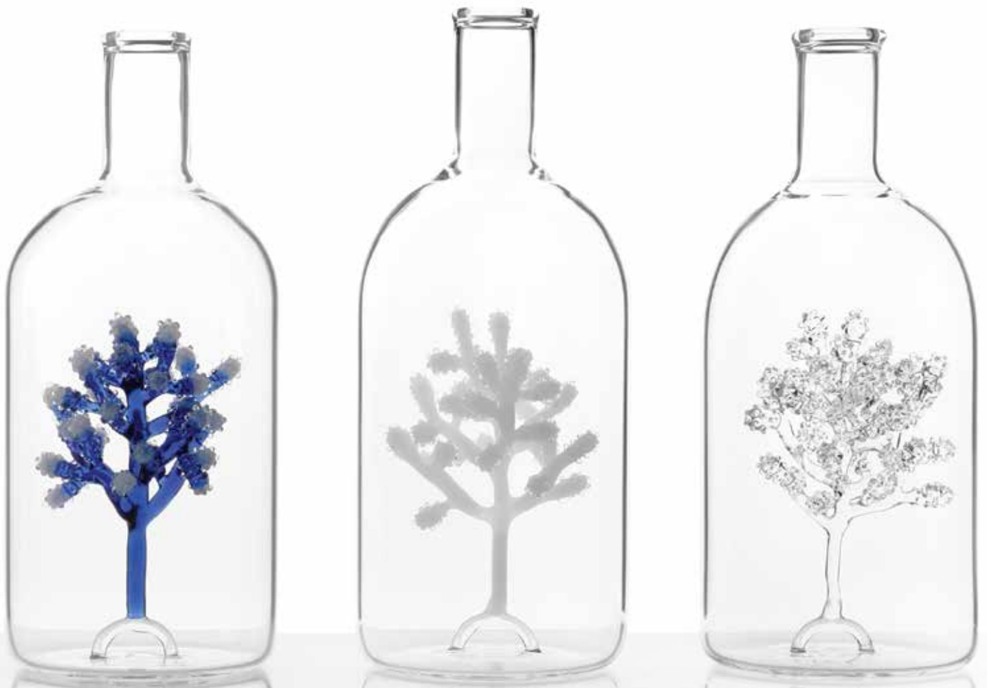
Elena Fleury-Rojo, Message in a Bottle, 23.5 cm x 47.5 cm x 10 cm.