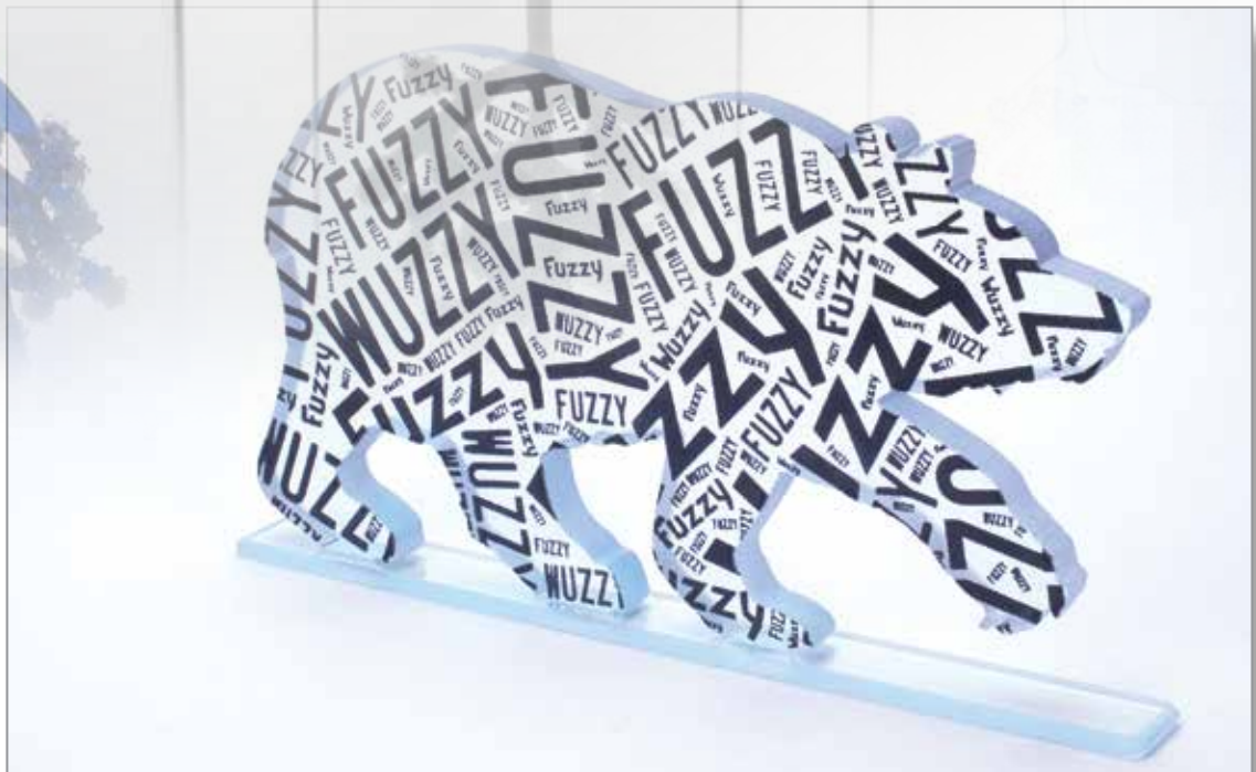
Rachel Elliott, Fuzzy, 110 mm x 115 mm.