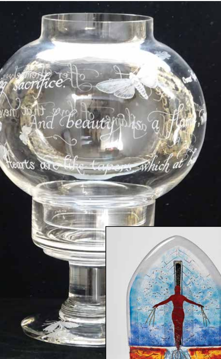
Sue Burne, Beauty is a Flame , height 20 cm.

The shows' themes are diverse and cover a wide range of topics, allowing everyone to exhibit their work. There are six shows per year, each lasting for two months. There is no limitation on technique, and a diversity of different ways of working is encouraged. Online exhibitions also enable CGS to feature the work of other organizations with which it collaborates. Such is the case with the Guild of Glass Engravers, as this traditional technique is not well represented among CGS members.