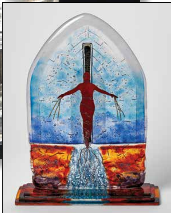
Teresa Chlapowski, Divine Feminine , 44 cm x 33 cm x 10 cm.