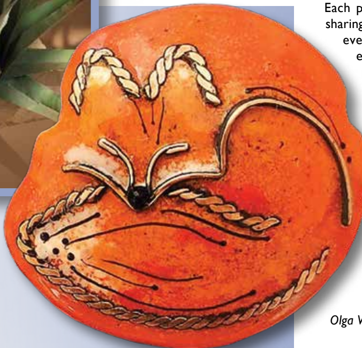
Olga Vilnova - Copper Wire on Lampwork