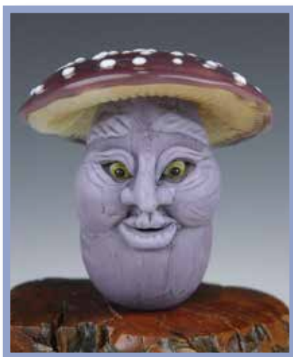
Presenter Kim Fields - Mushroom Man Demonstration

© Copyright 2024 by Glass Art®. All rights reserved.