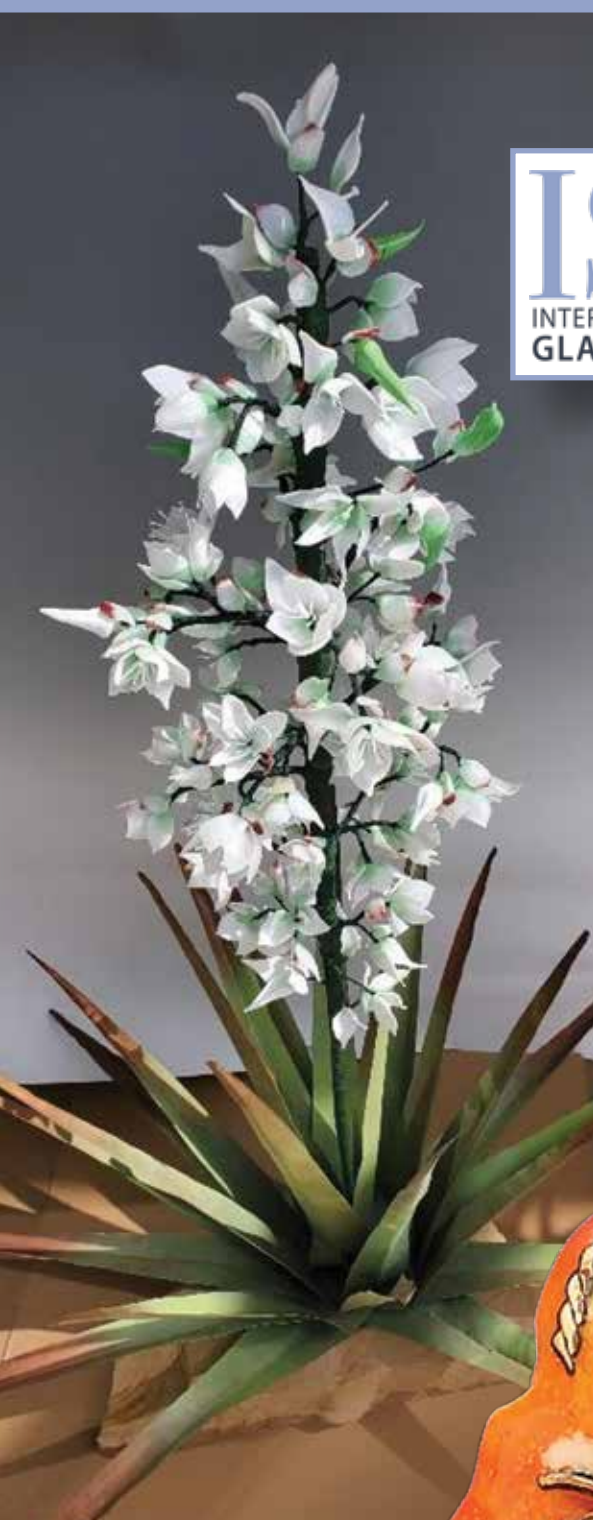
Presenter Carolyn Baum - Yucca Bloom

Each presenter had such enthusiasm for sharing their talents and love of glass that every attendee found something to excite them and use in their own practice. Presentations were a mix of demonstrations, tours, Flame Off , and glass artists sharing inspiration and were shown live with ample time for questions and answers. All attendees were given access to watch the recordings until July 2024 ended.