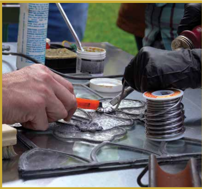
Lead medallion class at the 2023 Buffalo Conference.

Our conference is a vital hub for community building and mentorship opportunities within the architectural art glass field, catering to the diverse needs across all levels of expertise and experience. Join us in Kansas City for the 113th annual conference where creativity meets craftsmanship, and innovation reshapes the future of architectural art glass! GA