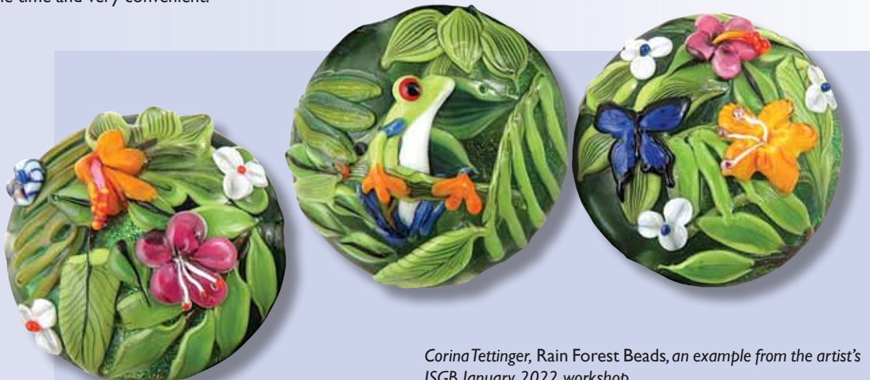
Corina Tettinger, Rain Forest Beads, an example from the artist's ISGB January 2022 workshop.