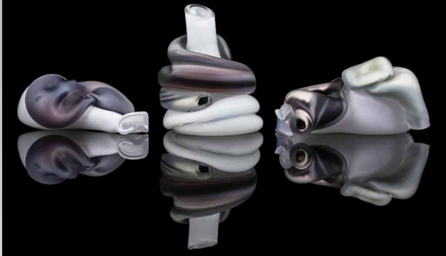
Featuring the latest from the Contemporary Glass Society