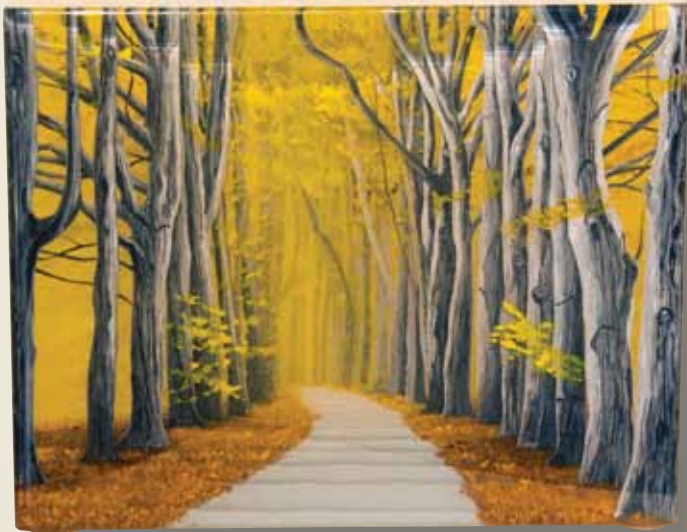
Oceanside Glass & Tile Special Paul Messink Autumn Dreams