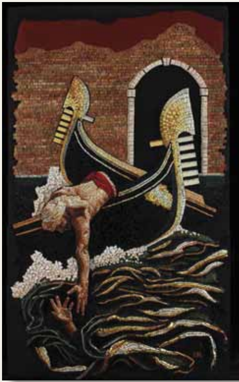
Michael Kruzich, Refuge, 5' x 3', stone, Italian smalti, and gold, 2017. Photo by the artist.