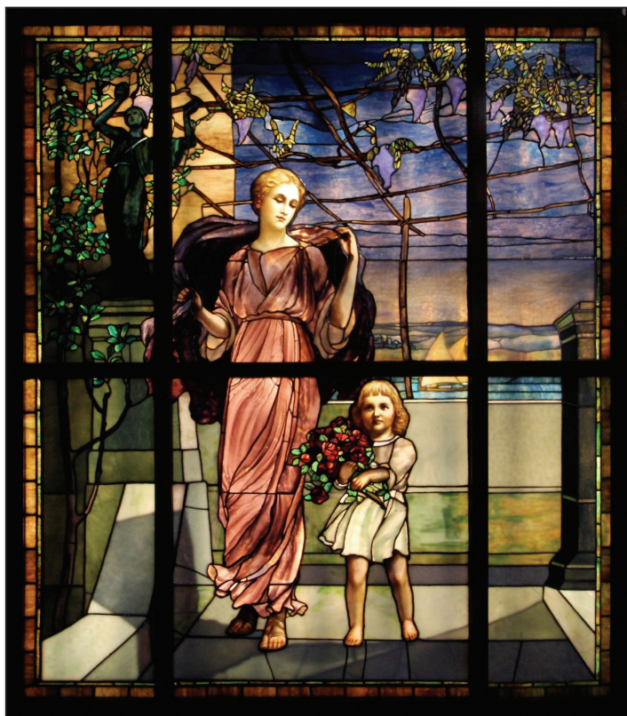
Lady with Child Tiffany residential window exhibited in the Halim Family Museum. Fully restored by Gilbertson's Stained Glass Studio.